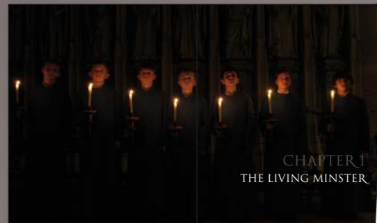
CHAPTER 1 THE LIVING MINSTER